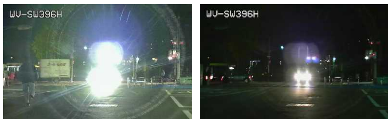
Figures 6 and 7. Left: the image is an example when Super Dynamic technology is turned off. Right: the image is an example when Super Dynamic technology is turned on.

Panasonic developed the industry's first Super Dynamic technology and improved it to Mega Super Dynamic technology, dramatically expanding the dynamic luminance range. The technology measures the luminance of each pixel on the image, adjusts the brightness of parts that are too bright or too dark to the appropriate brightness and produces a clear image. Electrical sensitivity enhancement keeps color images clear, even in dim light.