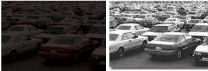
Figures 8 and 9. Parking at night. Left: camera runs in day-mode. Right: camera switches to night mode and infrared light (IR) enhances the image.