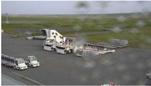
Figure 5. Airport on a rainy day. The left half of the dome is coated with Rain-Wash coating and the image is clear. For comparison, the right half is not coated.

The hydrophilic coating also offers self-cleaning as water washes away the dirt on the dome. The coating keeps the dome clean, simplifies cleaning work and saves maintenance costs.