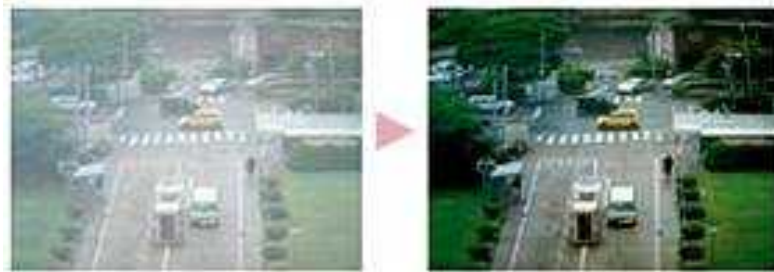
Figures 3 and 4. Outdoor gate. Left: the image is an example without fog compensation. Right: the image is an example with fog compensation running, which reduces the fog impact.

Panasonic Fog and Sandstorm compensation feature, an image processing technology, reduces the impact of fog, smog and sandstorms, delivering clear color images to the operators.