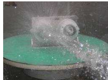
Figure 2. Water resistance test.

The International Electrotechnical Commission (IEC) defines the waterproof performance rating. The Ingress Protection (IP) rating classifies and rates the degree of protection mechanical casings and electrical enclosures provide against the intrusion of solid objects including body parts such as hands and fingers, dust, accidental contact and water. Panasonic outdoor cameras meet IP66, which indicates powerful performance: No dust ingress. The enclosure protects the camera against harmful effects from powerful water jets projected from any direction.