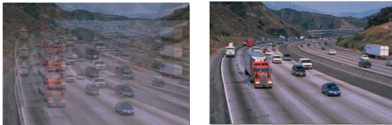
Figure 11. Free-way. Left: Vibration from the road affects the Image. Right: The Auto Image Stabilizer eliminates the vibration effects.

Panasonic Auto Image Stabilizer, an image processing technology, reduces the negative impact of vibrations and delivers clear images to surveillance operators.