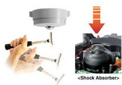
Figure 1. Tough camera protected with built-in shock absorber.

The focusing mechanism in the camera is designed to avoid images deteriorating from external mechanical shocks. Auto Back Focus (ABF) enables readjusting the focus remotely from an operation center if the camera becomes out-of-focus.