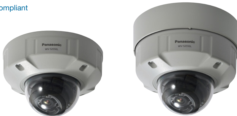
with Base Bracket