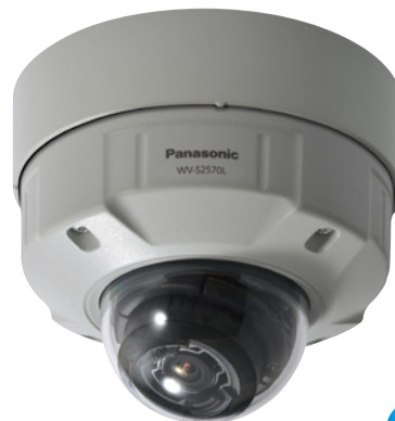
with Base Bracket