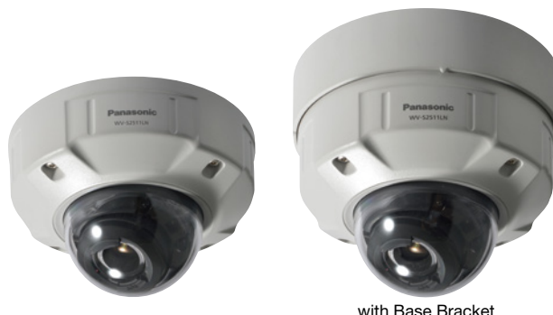
with Base Bracket