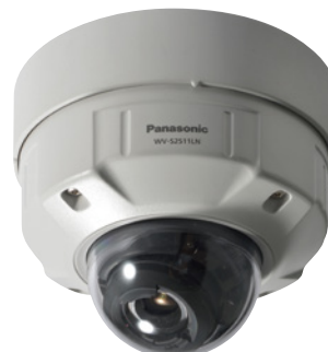
with Base Bracket