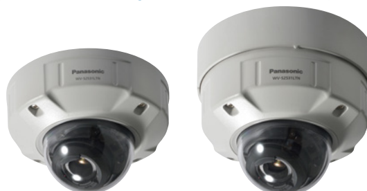
with Base Bracket