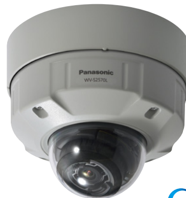
with Base Bracket