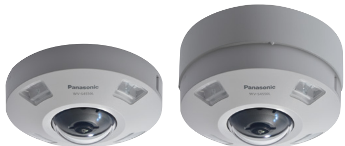
with Base Bracket