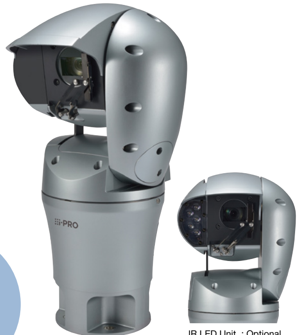
WV-SUD638 (Natural Silver) WV-SUD638-H (Gray) WV-SUD638-T (Brown)