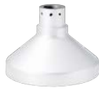
WV-QSR501-W Mount Bracket