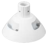
WV-QSR504S-W Mount Bracket