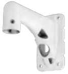
WV-QWL501S-W Wall Mount Bracket