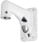
WV-QWL501-W Mount Bracket

Select a compatible accessory Accessory Selector (i-pro.com) .