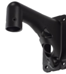
WV-QWL501-B Mount Bracket