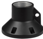
WV-QCL101-B Mount Bracket